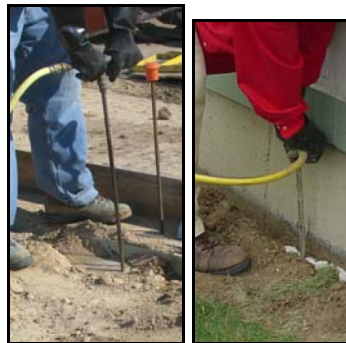
Far left: The applicator completes the interior vertical application before the flat concrete surface is poured.

Vertical chemical barriers must be established in the soil around the base of foundations, plumbing fixtures, foundation walls, support piers and voids in masonry, and any other critical area where structural components extend below grade.