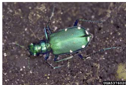
Six-spotted Tiger Beetle