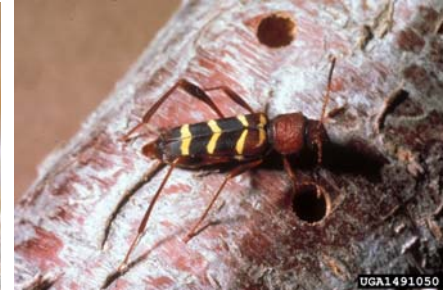
Red Headed Ash Borer