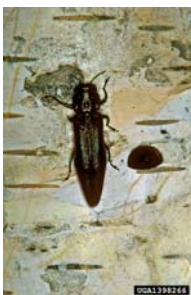
Bronze Birch Borer