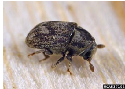
Eastern Ash Bark Beetle