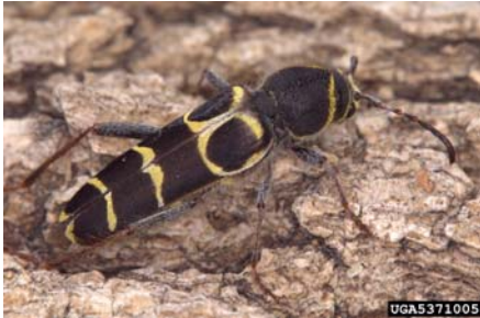
Banded Ash Borer