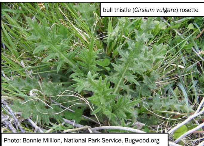
bull thistle ( Cirsium vulgare ) rosette