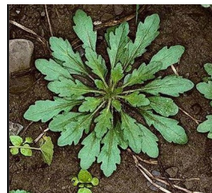
Canada horseweed rosette.