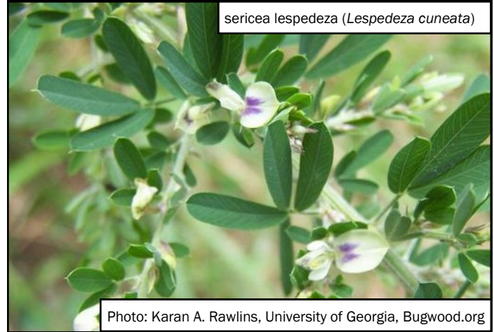
sericea lespedeza ( Lespedeza cuneata )

The plant species composition of a site, whether it is a roadside ditch or pastureland, is critical in determining proper control techniques,