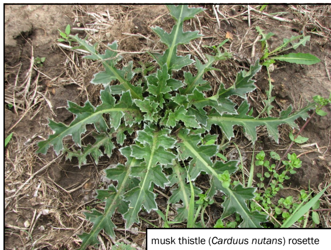
musk thistle ( Carduus nutans ) rosette

As summer temperatures begin to cool in the autumn of each year, freezing conditions spread across Kansas (Figure 1). The effect these temperatures have on different weeds is dependent upon the plant species. Some plants are killed by the first frost of the year while others can survive a hard freeze. But what do the terms first frost or hard