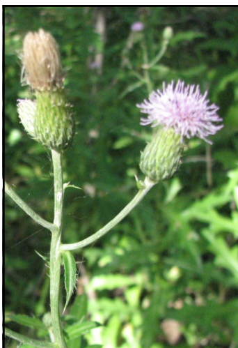
Canada thistle ( Cirsium arvense )

During spring, plants send those same sugars to the leaves and growing tips to provide energy for plant growth. In essence, the plumbing of the plant is pushing water out of the roots and into the leaves. Thus, if you spray a plant with a translocatable herbicide during this period, the leaves and stems of the plant may die, but the roots can survive.