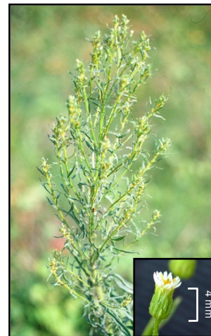
Canada horseweed stem and flower.