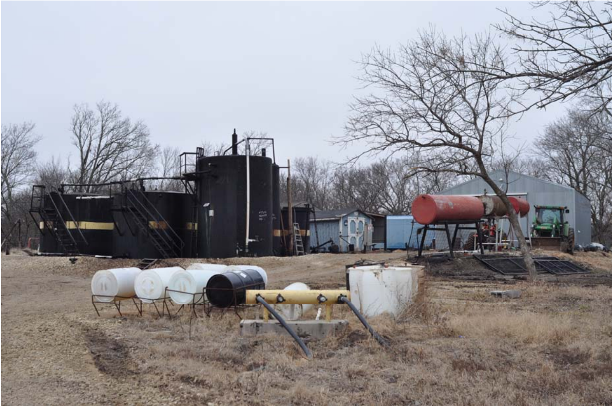
Photo of petroleum tanks in Kansas